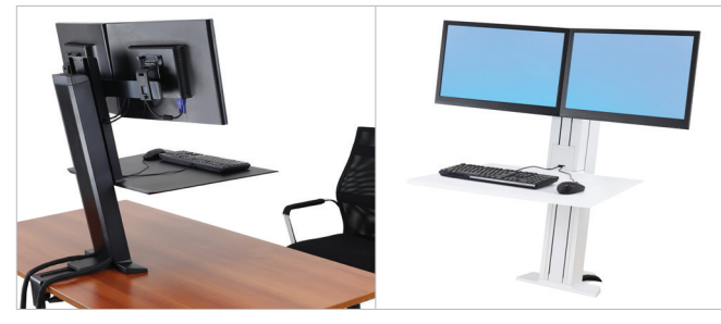
Available in black or white finish