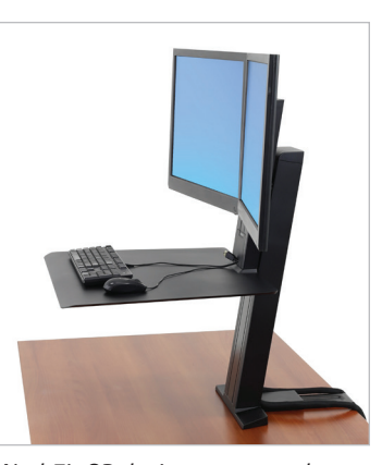
WorkFit-SR design prevents the keyboard tray from intruding into your space