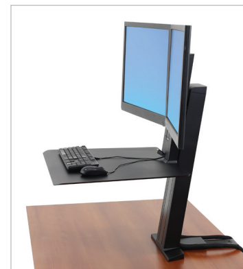
WorkFit-SR design prevents the keyboard tray from intruding into your space