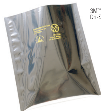
3M™ Moisture Barrier Bag Dri-Shield 2000

These bags are tested to meet or exceed certain electrical and physical requirements of ANSI/ESD S541, and to be ANSI/ESD S20.20 program compliant. Bags are RoHS Compliant* and lead-free**.