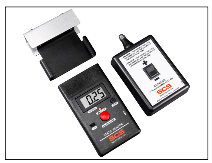
Figure 2. SCS 770717 Air Ionizer Test Kit