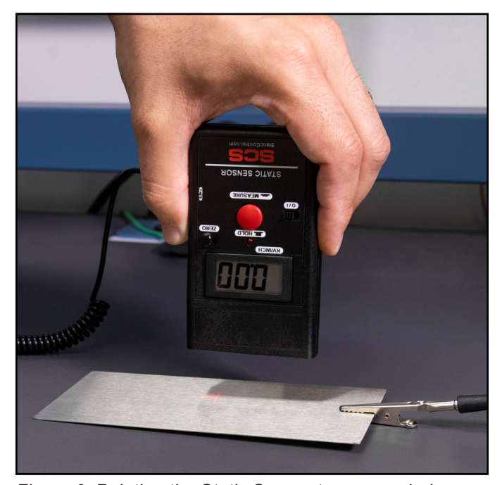
Figure 6. Pointing the Static Sensor to a grounded surface

Slide the power switch to the right to power the Static Sensor. Point the top of the Static Sensor approximately 1 inch (2.5 cm) away from a grounded metal surface. Proper spacing is indicated when the two red bullseyes emitted LED range indicator become centered on top of each other. Turn the rotary zero knob until the Static Sensor's display reads 0.00.