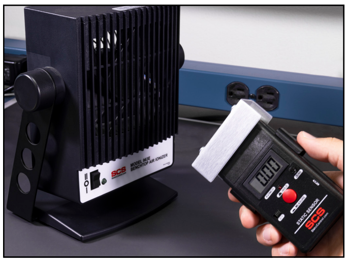
Figure 9. Using the Static Sensor with Conductive Plate to measure the offset voltage of a benchtop ionizer

NOTE: When testing pulsed ionizer systems, the voltage displayed is constantly changing. This pulse rate may be faster than the display update rate of the Static Sensor, therefore the displayed voltage is an average of the actual voltage. The output of the Static Sensor is useful in this situation for more accurate measurements.