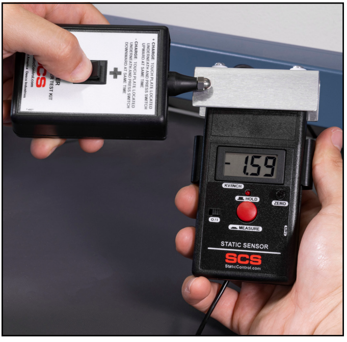
Figure 10. Using the Charger to apply a charge onto the Conductive Plate

NOTE: A ground path must be provided between the touch plate of the Charger and the ground reference of the Static Sensor. This is normally provided by holding the Charger in one hand and the Static Sensor with Conductive Plate in the other.