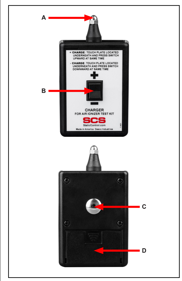
Figure 5. Charger features and components