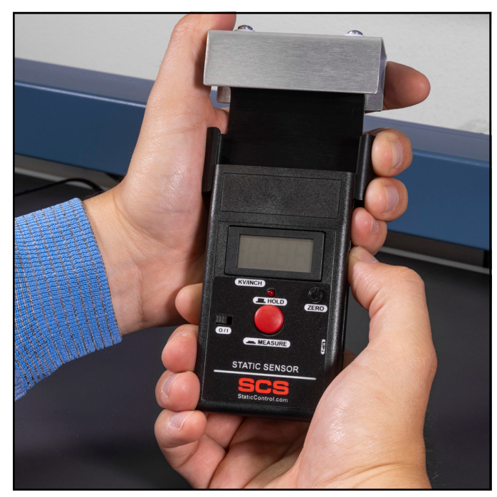
Figure 8. Sliding the Conductive Plate onto the Static Sensor