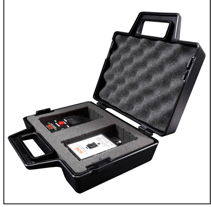
Figure 3. Air Ionizer Test Kit and Carrying Case