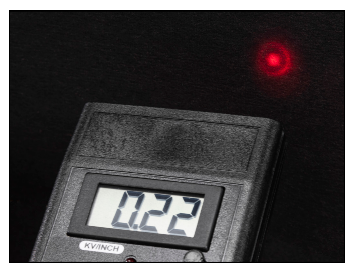
Figure 7. Aligning the two bullseyes emitted by the LED range indicator