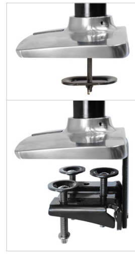
DESK CLAMP ATTACHES TO EDGE UP TO 2.5" (65 MM) THICK