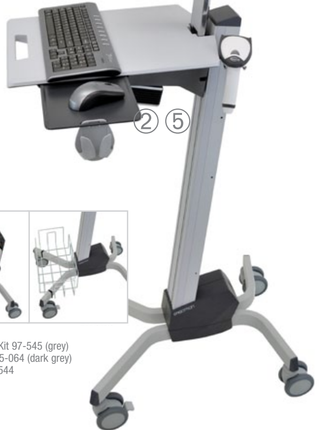
NF Cart Laptop Vertical Kit 97-546